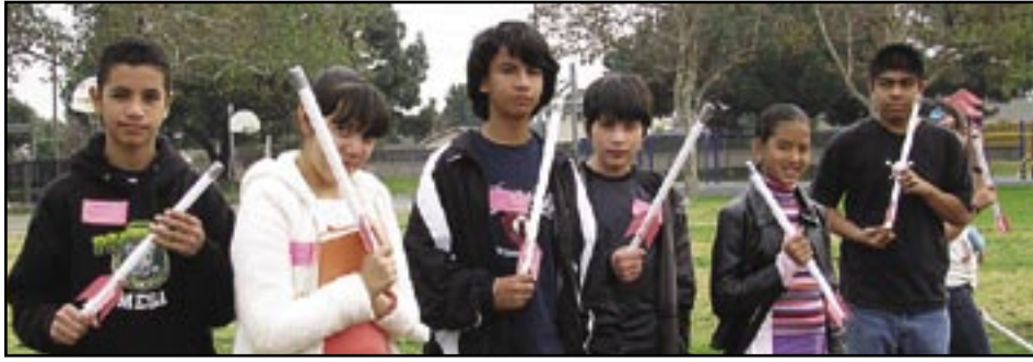
6th-8th grade students waiting to launch their handmade rockets