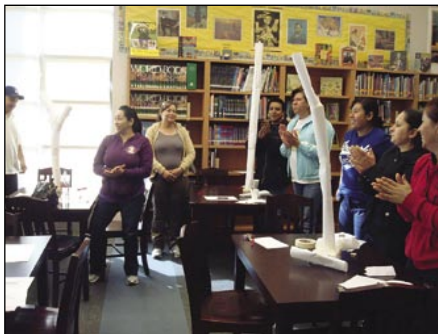
At Coffee with the Counselor, parents enjoyed working together on a cooperative learning activity.

Getting along with others is not always an easy task, whether it's your friends, neighbors, family members, in-laws, or co-workers. As adults we have all experienced a time where it was difficult to get along with someone. Adults, however, have learned to utilize certain social skills to assist in this process. Children must also acquire these skills in order to get along with their peers. Parents are a child's first teacher. In our Coffee with the Counselor meeting, Jefferson parents explored strategies for teaching their child How to Get Along with Others.